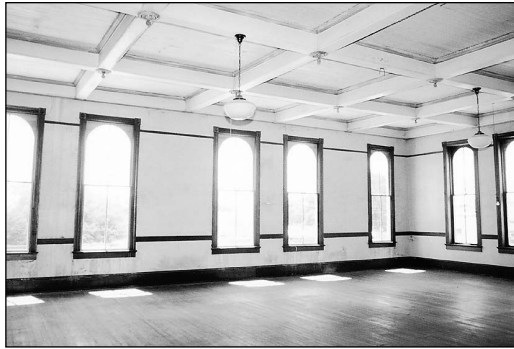
Left: East Room Before-and-after photos from Phase One restoration, now complete, show restoration of the original windows.