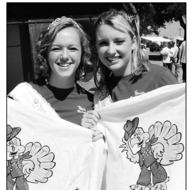
Thanks to the Lower Colorado River Authority for sponsoring our Turkeyfest Tees!